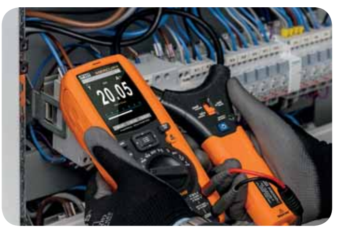
AC current measurement.