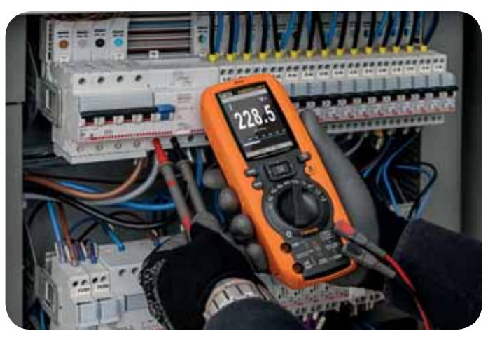
AC voltage measurement.