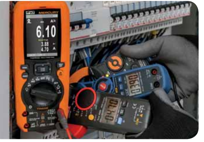
AC+DC current measurement comparison: 3.9A with RMS clamp, 4.7A with TRMS clamp, 6.1A with AC+DC TRMS clamp.