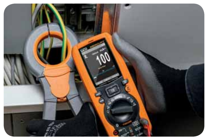
AC leakage measurement.