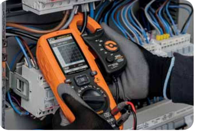
AC+DC current recording.