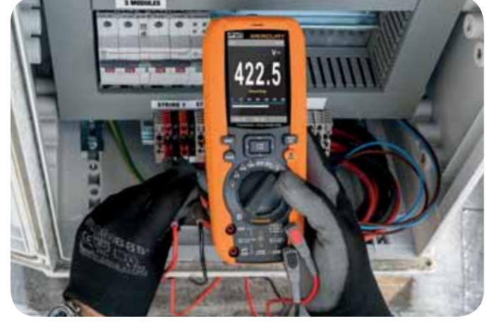
PV string Vmpp measurement