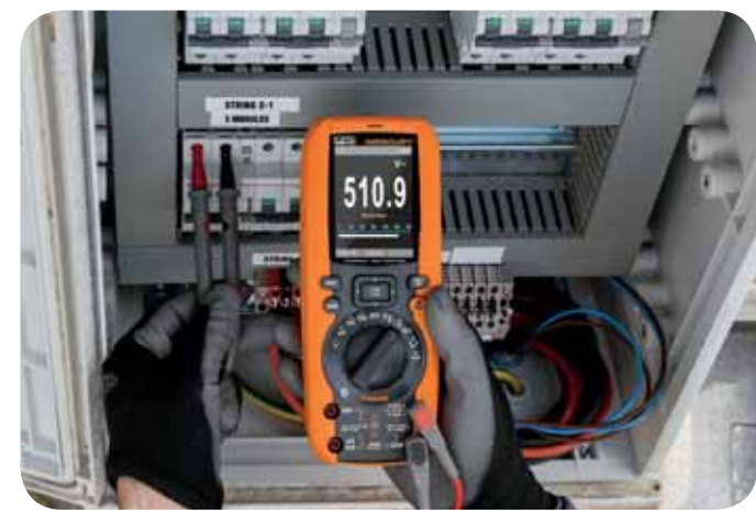
PV string Voc measurement