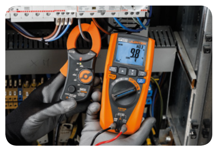
Current harmonic measurement.