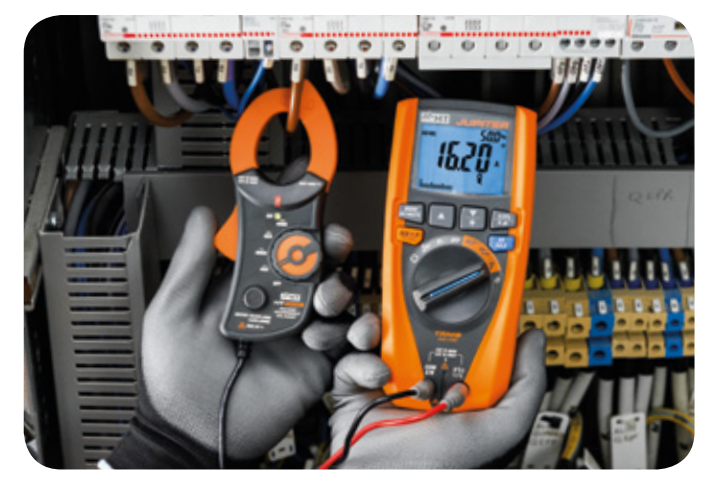
TRMS AC+DC current measurement.

Telefon: +41 44 933 07 70 | Telefax: +41 44 933 07 77 E-Mail: info@optec.ch | Internet: www.optec.ch