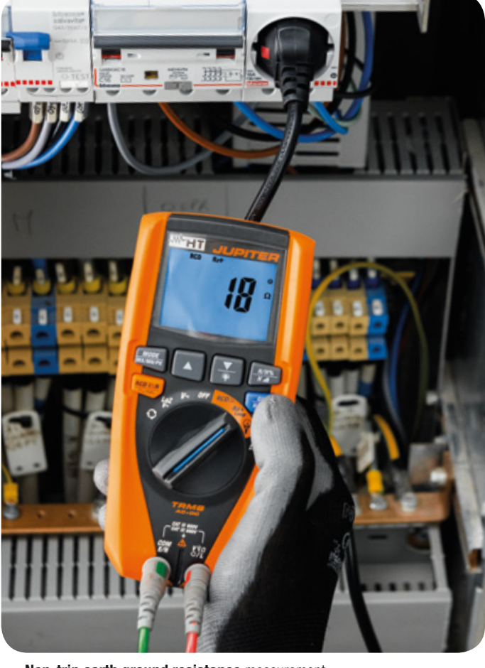
Non-trip earth ground resistance measurement.