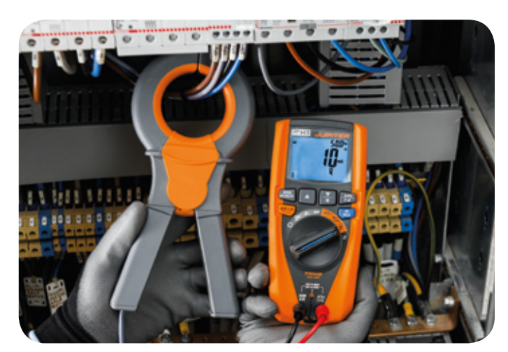
Leakage current measurement.