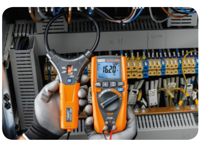
AC current measurement with flexible transducer F3000U.