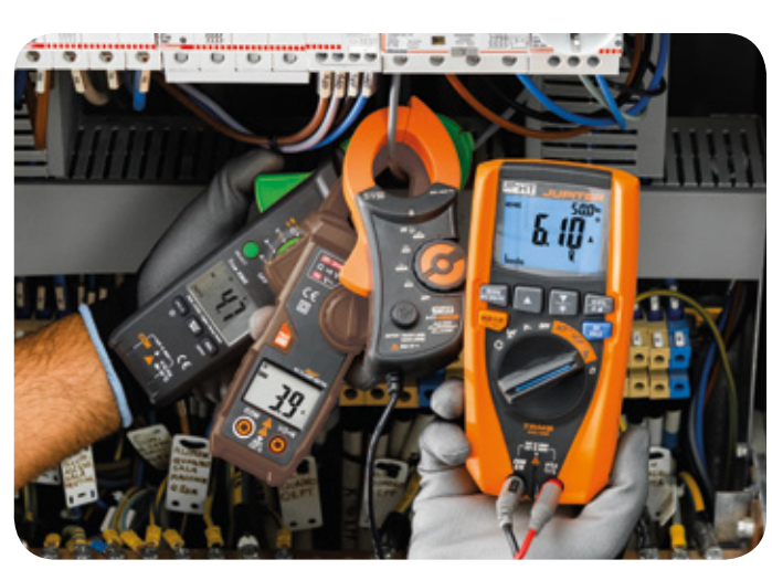
\label{lem:measurement} \textbf{Measurement comparison: } 3.9A: with RMS \ clamp - 4.7A: with TRMS \ clamp \\ \textbf{6.1A: correct reading with AC+DC TRMS clamp}.