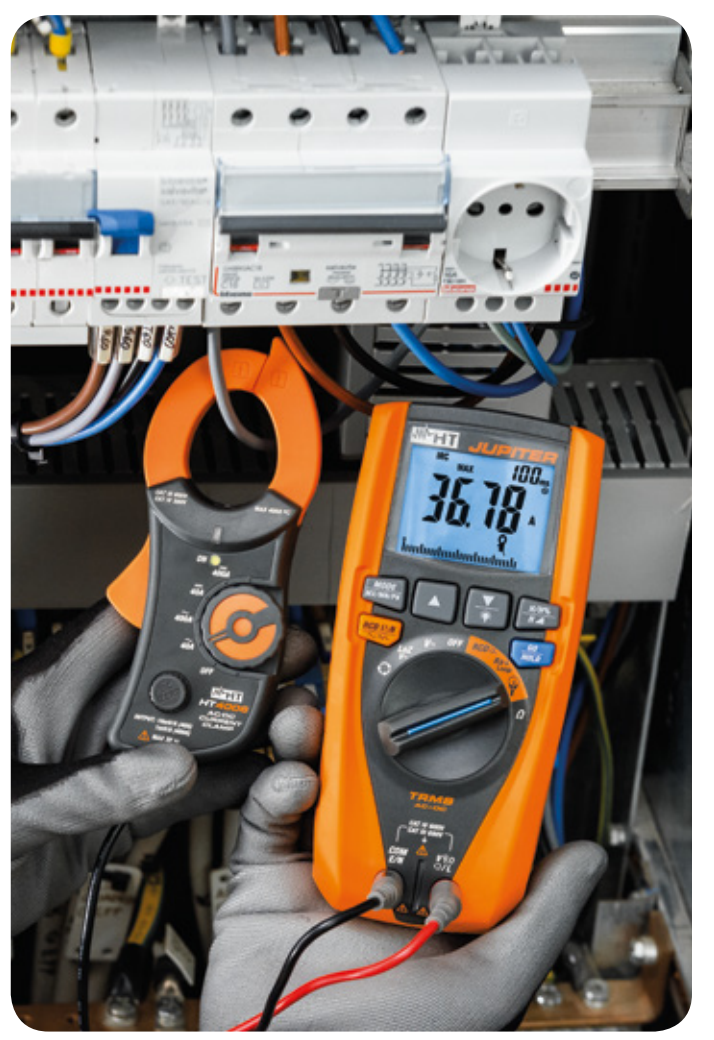
Inrush Current measurement.